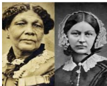
Mary Seacole and Florence Nightingale.